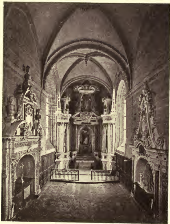
CHAPEL AND SHRINE OF ST. VINCENT FERRER IN THE CATHEDRAL, VANNES.

(The relics are in a coffer beneath the statue of the saint.)