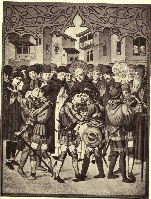
"ST. VINCENT FERRER RECONCILING ENEMIES."