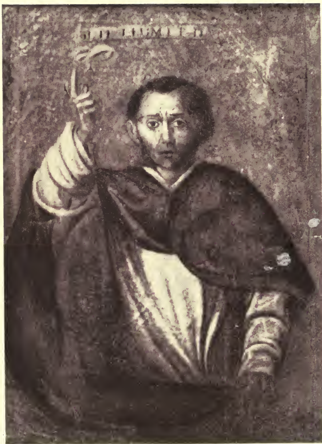
THE MOST AUTHENTIC EXISTING PORTRAIT OF ST. VINCENT FERRER.