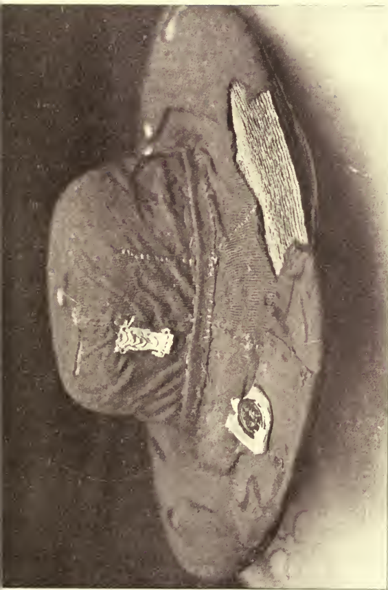
HAT WORN BY ST. VINCENT FERRER. (Preserved in the Dominican Monastery, Lyons.)